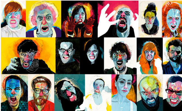
"Angry People."